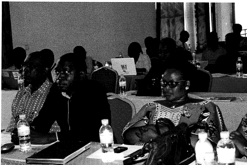
Cooperation between politicians and journalists was enhanced